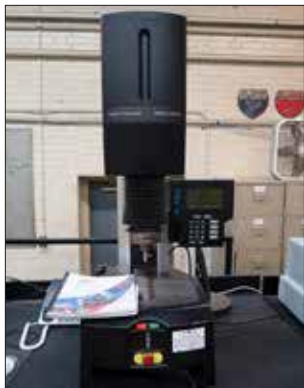
Wilson Rockwell 2001R Digital Hardness Tester