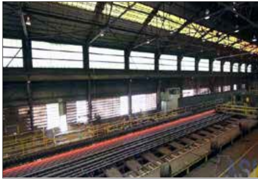
26 W x 80 Ft L Billet Infeed Hot & Cold Table