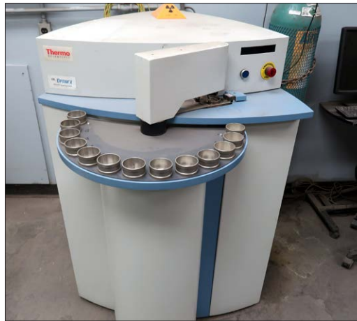
Thermo Scientific ARL Optim'X Spectrometer