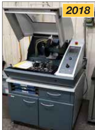
Struers Discotom Auto. Saw