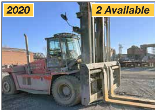
Kalmar DCG250-12 55,000-Lb. Diesel Lift Truck