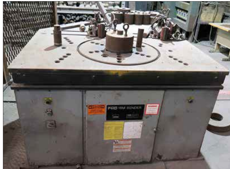
KRB 18M Electro-Mechanical Rebar Bender

Auctioneer will consider pre-auction offers on select items, please contact Paul Brown at (203) 313-8935, or pbrown@gagroup.com