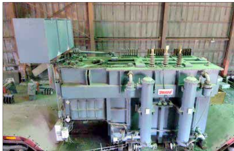
Tamini Transformer 107 MVA EAF 3-Phase Transformer, 34.5 kV Rated Voltage

For information, please contact Paul Brown (203) 313-8935, pbrown@gagroup.com