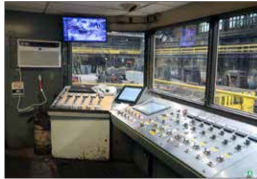
Rockwell Automation Control Room