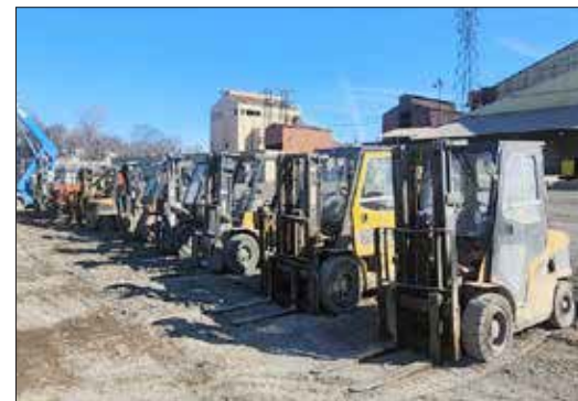
Partial Overview of Material Handling