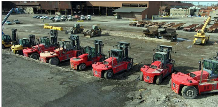
Partial View of Kalmar Lift Trucks