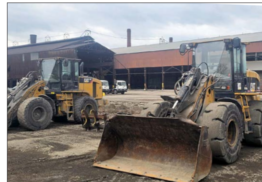
Partial View of Caterpillar Wheel Loaders