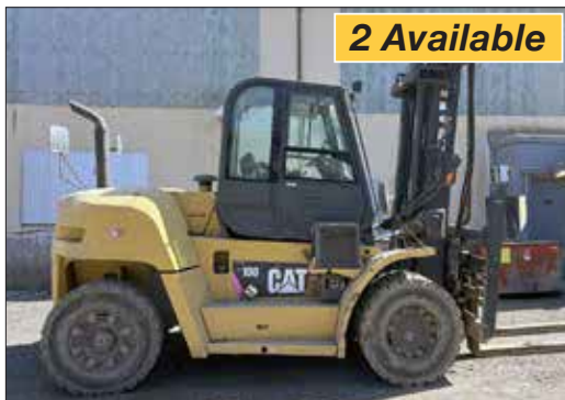
Caterpillar P22000 22,000-Lb. Diesel Lift Truck