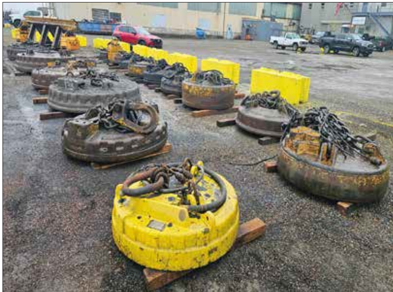
Partial View of Magnets