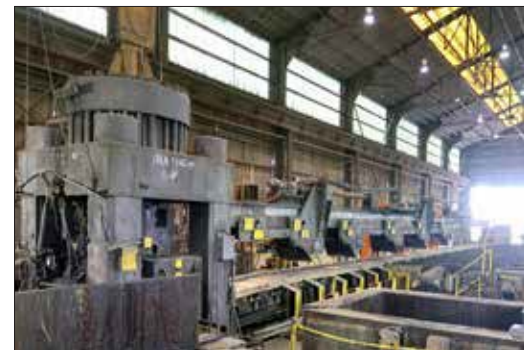
Advanced Machine Design 4" Hydraulic Bar Shear

Auctioneer will consider pre-auction offers on select items, please contact Paul Brown at (203) 313-8935, or pbrown@gagroup.com