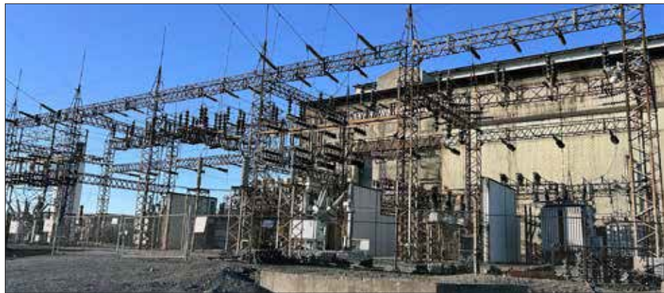
Partial View of Transformers