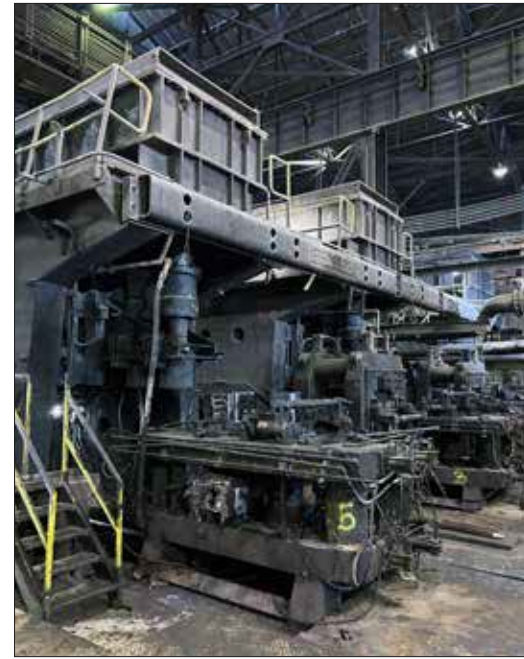
Birdsboro 5-Stand Billet Breakdown Mill

• MOELLER NEUMANN CONTINUOUS ROLLING MILL , with a bar capacity Diameters :0.750" to 3.9" Length 16' to 60', (Capable of Rounds, Round-cornered Squares, Hex, and Bar-in-coil), consisting of Charge Table with Unscrambler & Index Table, Allen Bradley CTR, Natural Gas Fired Pre-Heat Furnace w CTR, Birdsboro 5-Stand Billet Breakdown Mill , Blaw Knox Entry Pinch Roll, Blaw Knox #1 Shear, Moeller Neumann Roughing Mill with (4) Neumann 16" x 27 1/2" Vertical & Horizontal 2 High Mill Stands w/ 600 HP Dc Motors with Electric Controls, Moeller Neumann Intermediate Mill with (5) Neumann 16" x 27 1/2" & 15" x 24" Vertical & Horizontal 2 High Mill Stands w/ 500-600 HP Dc Motors & Electric Controls & (3) Neumann 2 High Mill Stands, (2) 2017 Lap Model RDMS 120-4 Measuring Machines, Cold & Hold Infeed Table 26' x 80', Blaw Knox Shear 500 Ton 2" Round Cap 175' Bar Cooling Bed & Shuffle Table, Advanced Machine Design 4" Hydraulic Bar Shear with Bar Table, (6) GE Transformers, Rockwell Automation Overall Line PLC Controls, Shipping Station; with 60' Run Out Table, Cooling System; with (5) 150 hp Pumps, Spare Mill Stands; Rolls; Crop Shears; Pinch Rolls; Transfer Rolls; Feed Tables; Motors; PLC and Solid State Controls; Burners; Hydraulic and Cooling Systems; Hot and Cold Well Pumps; Pump House Scale Drag System; Process Piping; Valves; Controls; (3) Hot Wells; (3) Cold Wells; Cooling Tower