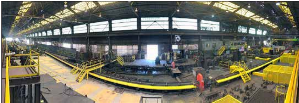
Overview of Moeller Neumann Continuous Rolling Mill