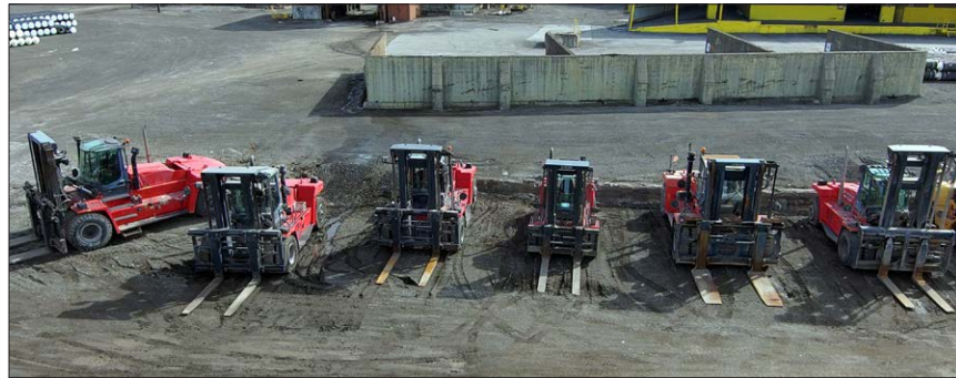
Partial View of Kalmar Diesel Forklifts