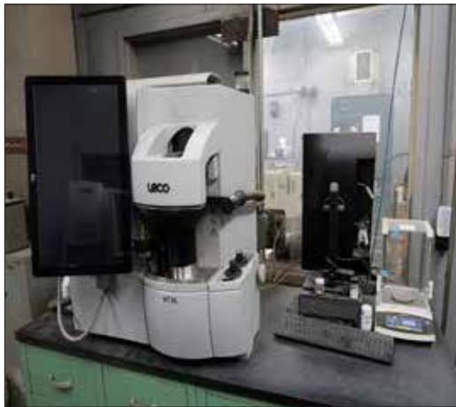
LECO N736 Oxygen Nitrogen Analyzer