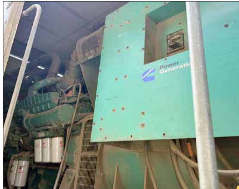
Cummins DFGE 5693579 750 KW Diesel Generator