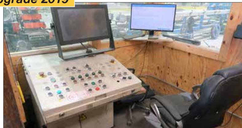
Kieserling WDH-125 Bar Peeler