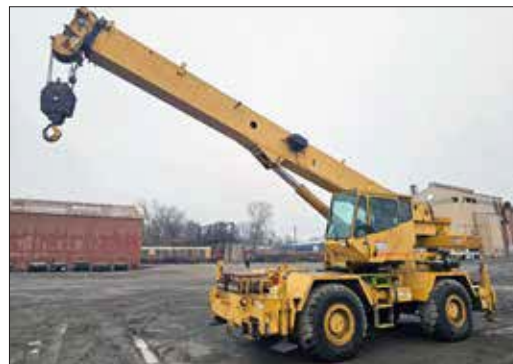
Grove RT530E 30-Ton Rough Terrain Boom Crane