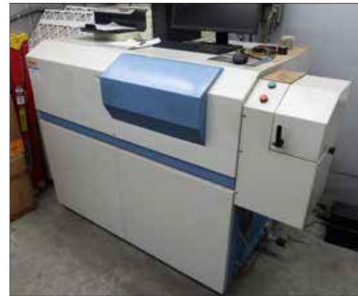
Thermo ARL3460OES Optical Emission Metals Analyzer