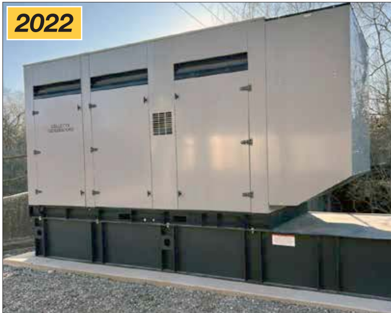
Gillette SPVD-6000-3-4-2, 660-kW Diesel Generator