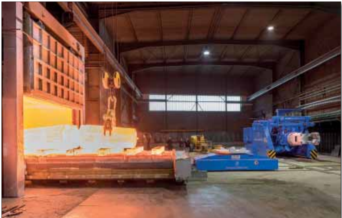
Fig 3 The digital maintenance tool ensures the high productivity of the rail-bound forging manipulators

The additional sensors record parameters such as: