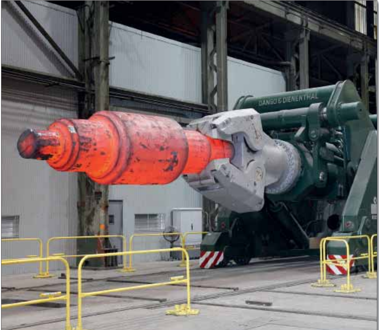
Fig 1 A rail-bound forging manipulator from the SSM series