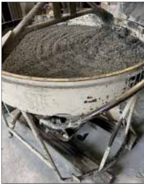
Fig 1 Flow consistency