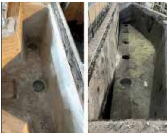
Fig 2 Tundishes lined with SURCAST QUICKSTART