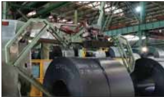
🔍 Fig 3 Robotic eye strapper installation