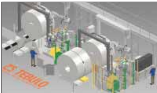
🔍 Fig 4 Continuous Galvanizing Line design