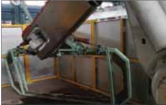
🔍 Fig 2 Robotic eye strapper in maintenance position