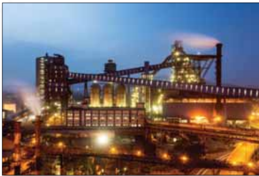
Fig 4 BF 'I', 2.5Mt/yr ironmaking plant of TATA Steel Ltd, Jamshedpur, India

of DRI per tonne of coke. Thus, it is more profitable to produce DRI than electricity provided that the selling price of 1 tonne of DRI is at least 10% higher than the price of 1MWh of electric power. Additionally, DRI production via MIDREX technology is superior to power generation, from an environmental point of view, particularly thanks to the lower specific NO x and SO x emissions [1].