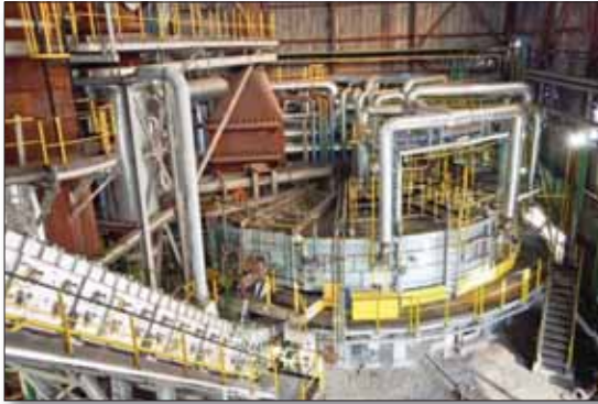
Fig 5 Rotary hearth furnace of RedIron recycling plant