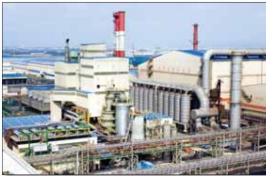
Fig 6 Primus dust recycling plant

PLD (Paul Wurth – Lhoist de-oiling) is a new technology for de-oiling polluted by-products generated by rolling mills, mainly mill sludge and scales [7]. The patented process consists of volatilisation of oil by using quicklime and its controlled oxidation at low temperature. A specially designed MHF serves as the reactor which allows intimate mixing of oily material with lime, facilitating a slow and efficient de-oiling process. The output material is a dry, fluid powder of iron oxide with a residual oil content of less than 0.1%. A basic, industrial configuration would be a 25,000t/yr oily material processing capacity, but feasibilities have been calculated for up to 100,000t/yr so far. The return of relatively pure iron oxide, for instance to a sinter strand, and avoided dumping cost, are the economic factors proving the PLD technology.