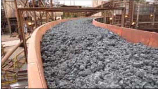
Fig 3 Circular sinter cooler at ArcelorMittal Tubarao, Serra, ES, Brazil