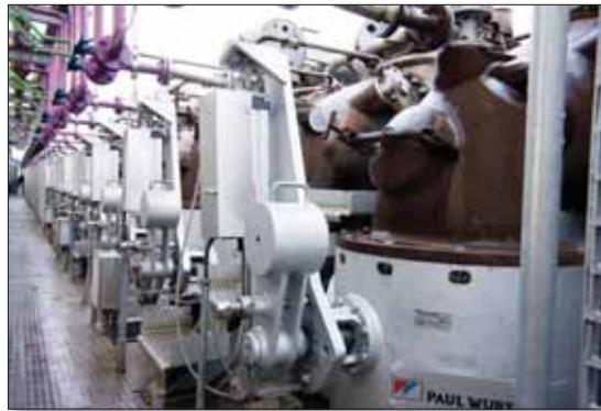
Fig 1 SOPRECO® valves

Possible use of excess gas The typical output of coke oven gas is about 450-500Nm 3 per tonne of produced coke. Especially for standalone coke oven batteries, the question of further use of the gas can offer up several answers. Coke oven gas has about 25-35% methane, 5-10% CO and 55% H 2 , with the potential for being burnt for the production of electricity or serving as reducing gas for iron production. Assuming the coke oven gas has a calorific value of 17.6MJ/Nm 3 and a power plant generation efficiency of 45%, the yield of electric power would be 0.96MWh from one tonne of coke. Alternatively, a coke oven gas-based, MIDREX® MXCOL® Plant (see Figure 2 ) engineered by MIDREX licensee Paul Wurth would produce 0.7 tonnes